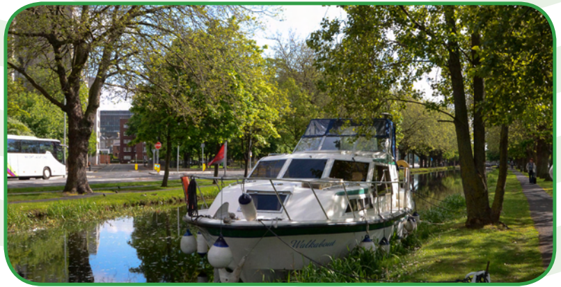
Walkabout at Mespil Road